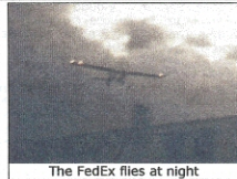
The FedEx flies at night