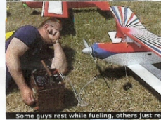
Some guys rest while fueling, others just rest.