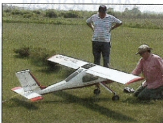
You can see the super slow flying Wilga towing gliders at Elmira Aerotow '98" near the National Soaring Museum at Harris Hill