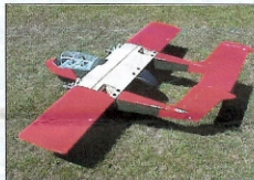
OV-10 Bronco from Rich Uravitch by Len Cataldi twin OS 35's