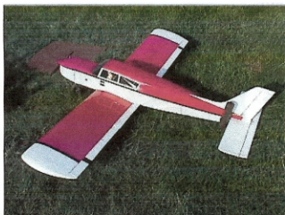
Great Planes Cherokee by Bill Eddy K&B 40