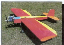
Tower Hobbies 4 pound UPROAR by Bill Brodner LA46 engine that gets 16000 rpm