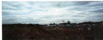
Cool and Windy Saturday Morning