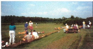
Northampton Model Flying Field Tuesday Training 07/97

The Radio Control Club of Rochester provides training for those interested, or even those who haven't decided whether or not they are interested, in the hobby. Proficient flyers are available on a volunteer basis, and usually there are three or four available on Tuesdays after 4 PM. There are also other experienced members available to check the plane for safety reasons such as structure, control linkage and attachment, radio operation; and they are anxious to answer any questions and offer a myriad of suggestions to the newcomer. RCCR members can arrange with individual instructors to meet at other times, but the encouragement is for Tuesday afternoons simply because the effort can be spread among the instructors and members.