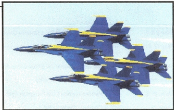
Threshold, The Blue Angels

Air Show 6/2/90 NA 6 Attack Carrier Trilogy NF 683 Aviation Heritage, Part I NF 696 Aviation Heritage, Part II WH 6 Aviation Unusual Highlights BA 29 B29, A Plane for a Mission Battle of Britain Down to the Wire, Wings of Eagles/Gold NA 34 Flying the AH-1G Cobra Gunship Fun & Float Fly; RCCR & Glider & Combat 1995 Kamikaze CB 12 Mighty Warbirds Naval Aviation Action, Part 1&2 BA 62 Proficient Flying, Volume 1 Proficient Flying, Volume 2 R/C Video Magazine Volume 3 R/C Video Magazine Volume 4 R/C Video Magazine Volume 5 R/C Video Magazine Volume 6 RCCR Scale Rally & Fun Fly 1988 S-T-A-R-S Meet 7/11/92 Shoot to Live Rear Gunner BA 18 Story of Naval Aviation, Attack Carrier NA 27 Striking Back, Byron Air Show Tailsipin Tommy, "Stunt Pilot" The Navy Flies On NA57