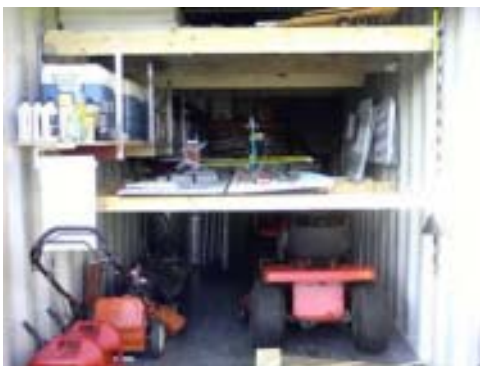
Container loaded for winter