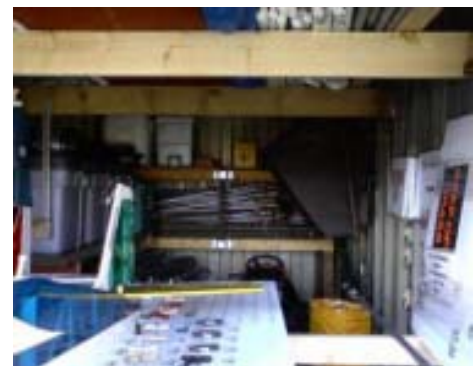
All neatly stored