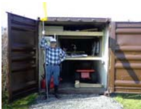
The Container Master on guard