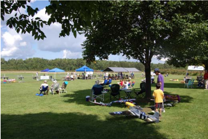
Great weather and lots of beautiful airplanes!