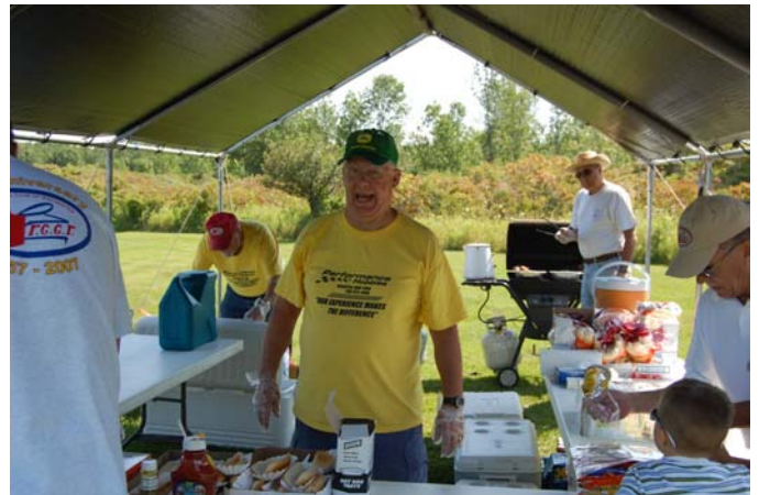
Business was brisk at the food stand.