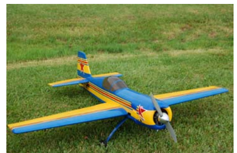
A few of the many beautiful planes that were brought out for everyone's enjoyment.