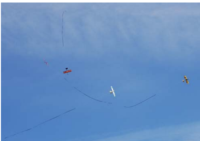
The flying was fast and furious, with many ribbon cuts and some mid-air collisions.