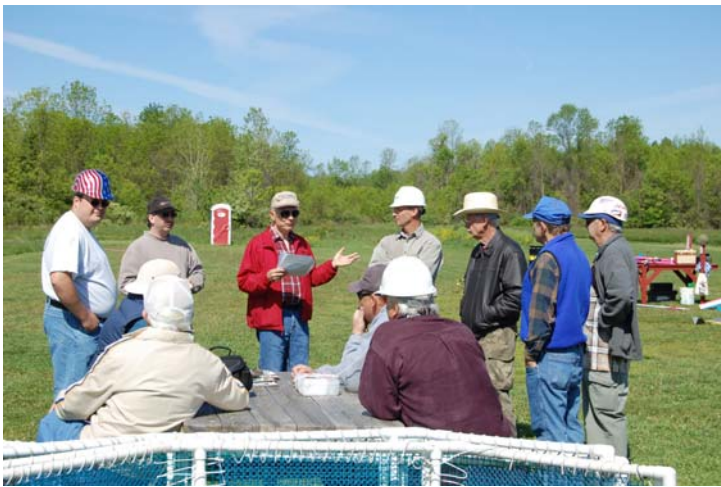
Rules, George? You never told me there were rules!