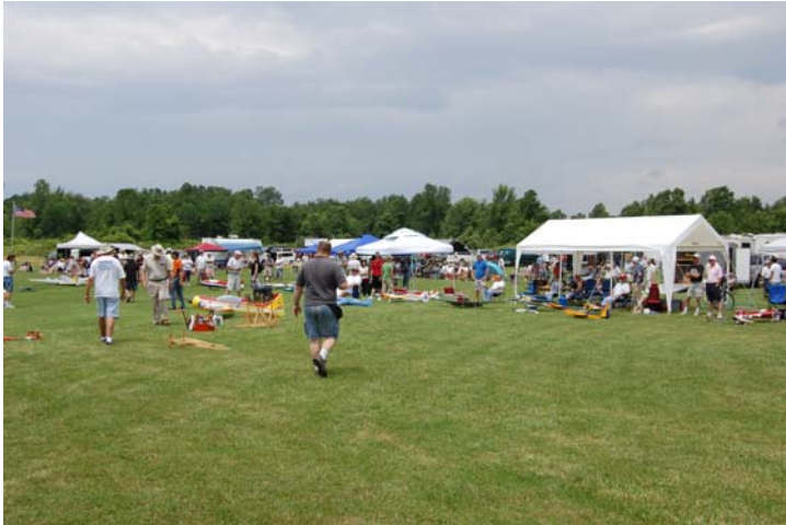
Pretty good turnout in spite of rain threat and wind.