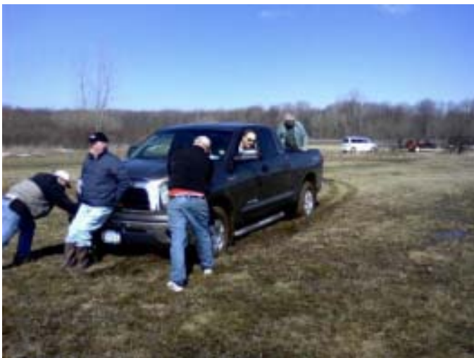
Professional drivers on closed course ....