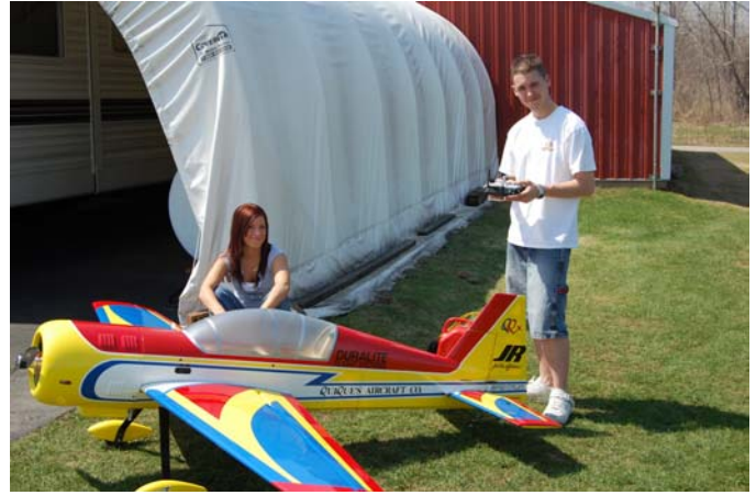
In the Spring, a young man's fancy turns to .... airplanes, of course.