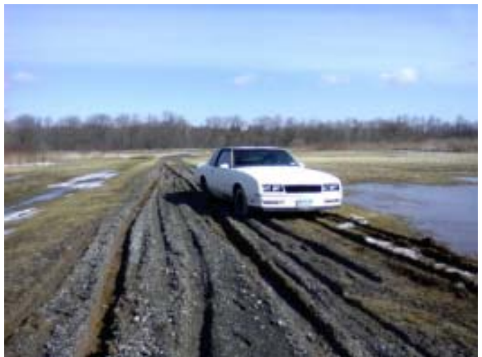
Do not attempt.