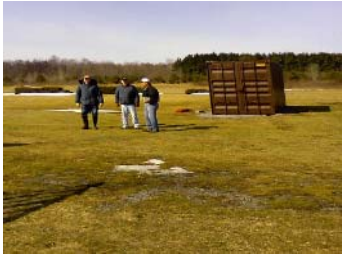
Container has been relocated to Northampton.