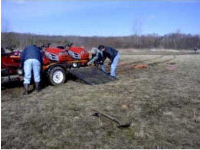
Tractors are loaded up and ready to go.