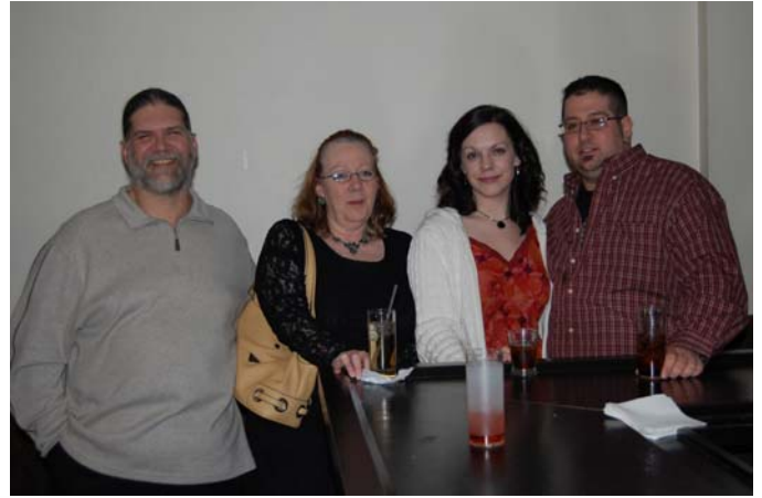
“Cutest Couples in Town” Award winners