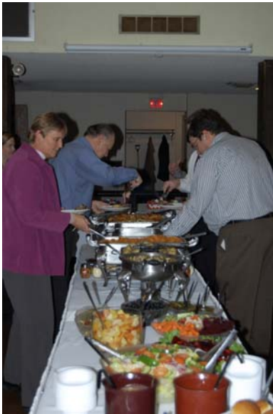
Great food, as always!