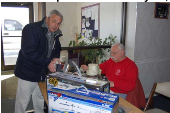
“I need to buy some more stuff.”