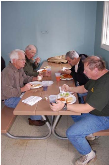
Everyone thoroughly enjoyed the catered luncheon.