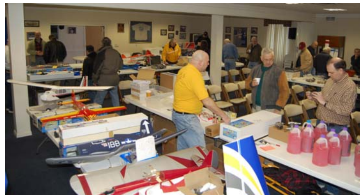
Lots of goodies on display.