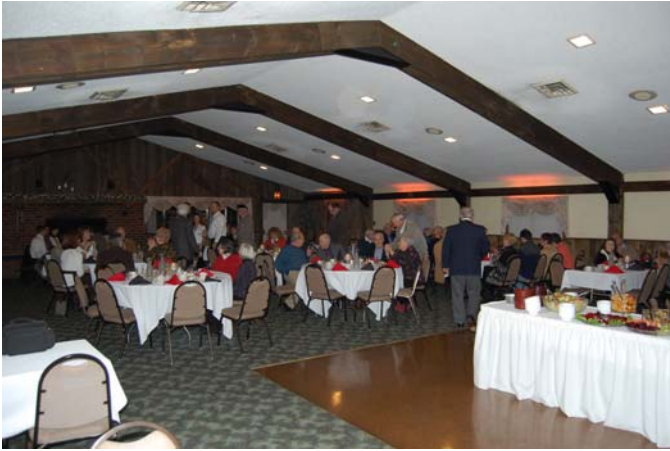
Over 70 people signed up – a record!