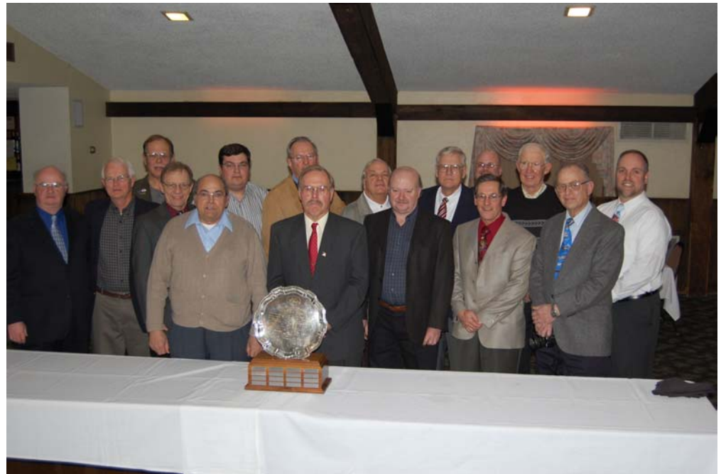
“Man of the Year Award” Recipients.