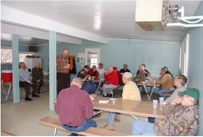
Trevor expressed the club's thanks to those who did so much work to maintain the flying fields.