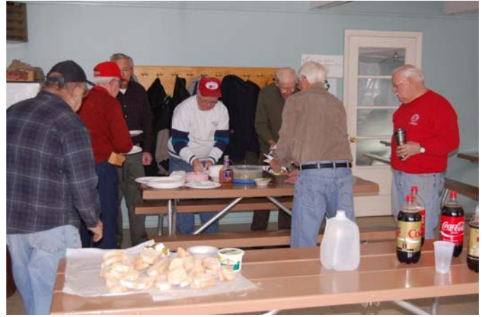
No one had to be called twice for lunch.