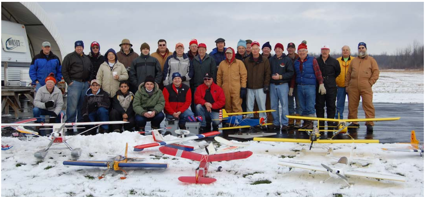
About 30 intrepid members braved the elements to help make this annual event a rousing success.