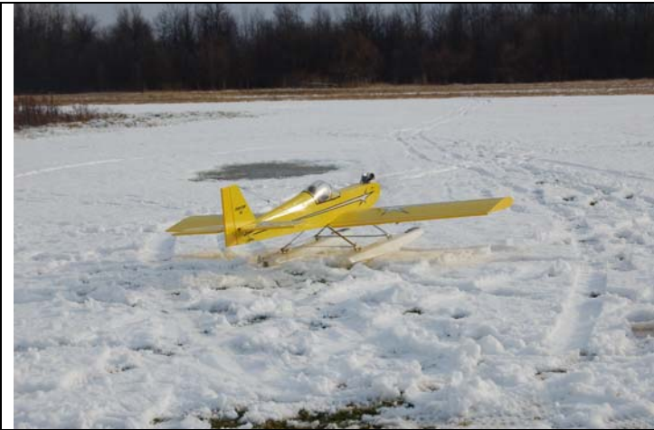
Trevor's Four Star 60 taxis out for another flight.