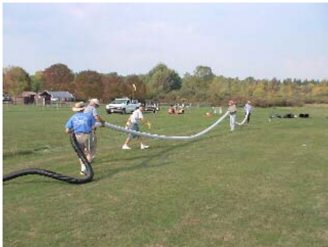
Prepping the pipe before installation