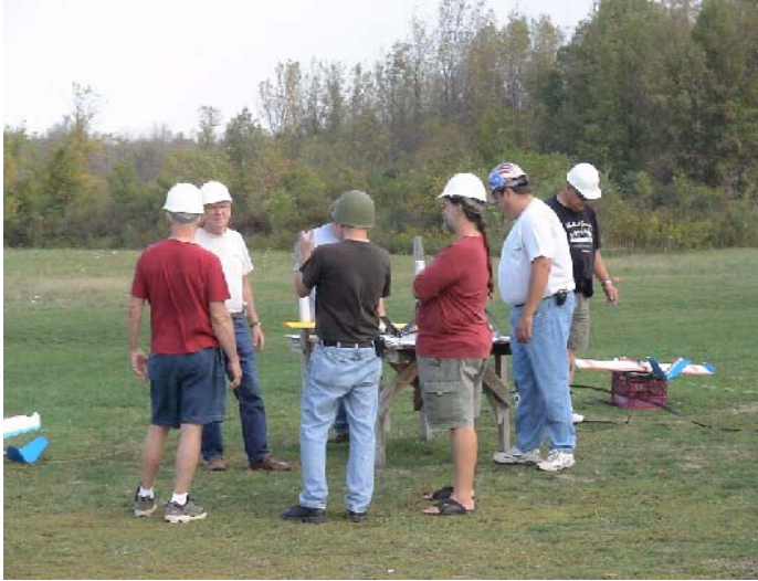
A good turnout of fliers and helpers