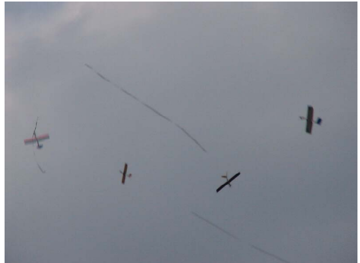
The action was fast and furious, with a few mid-air and lots of streamers cut