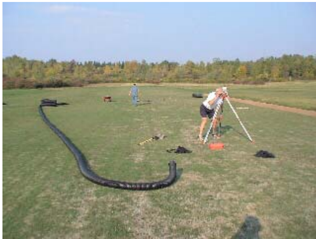
Getting the slope right takes real skill