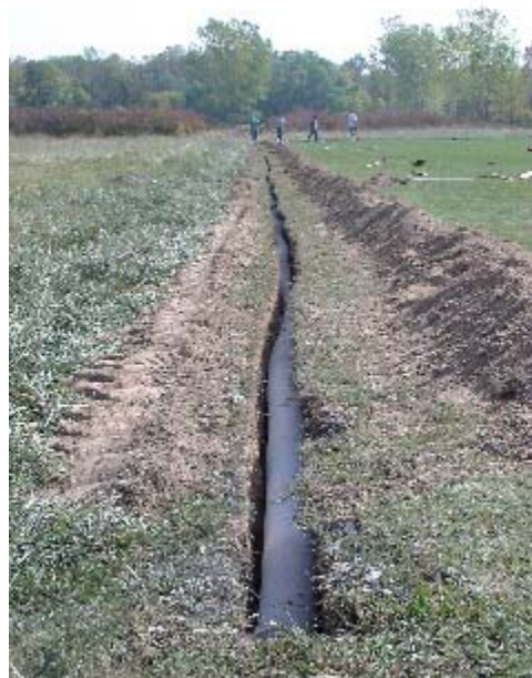
This gives some idea of the amount of work involved