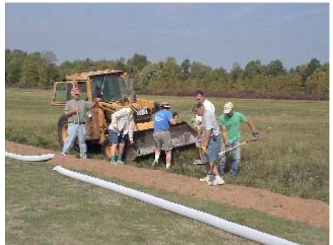
Covering the pipe with stone