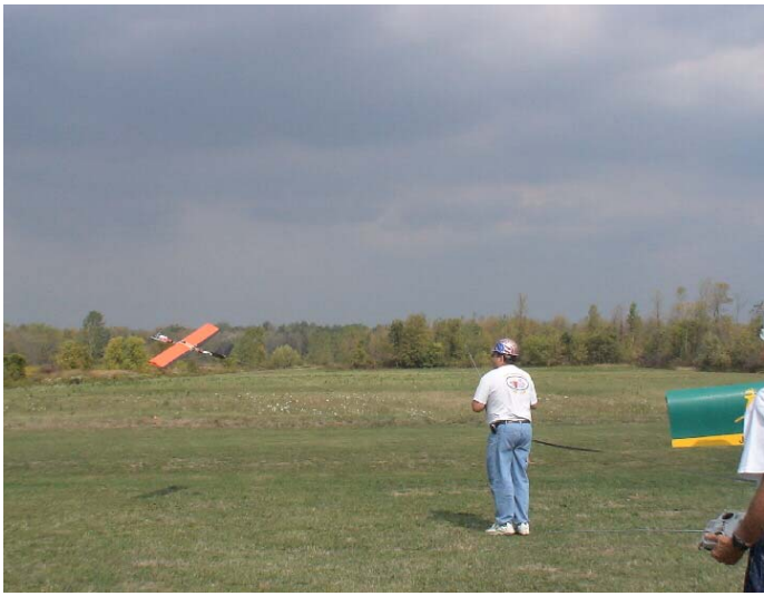
Matt launches smoothly in spite of the strong wind