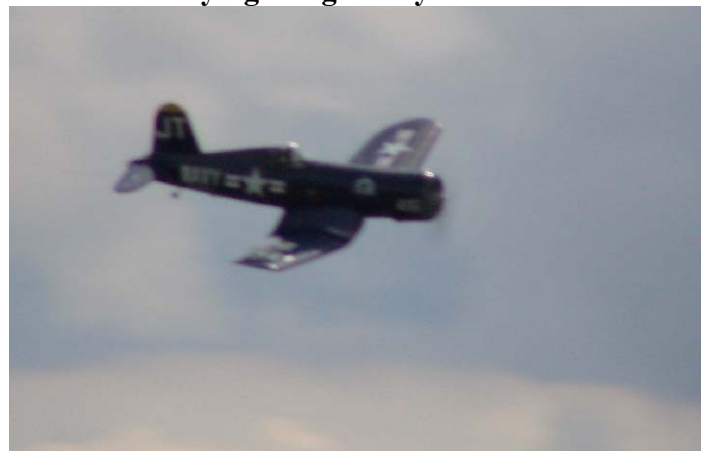
And it worked!