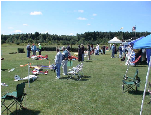
The weather really cooperated this year!