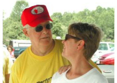
love at first bite.....