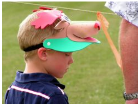
just me and him