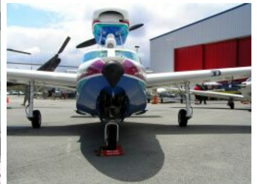
LEARN TO FLY A LAKE AMPHIBIAN!