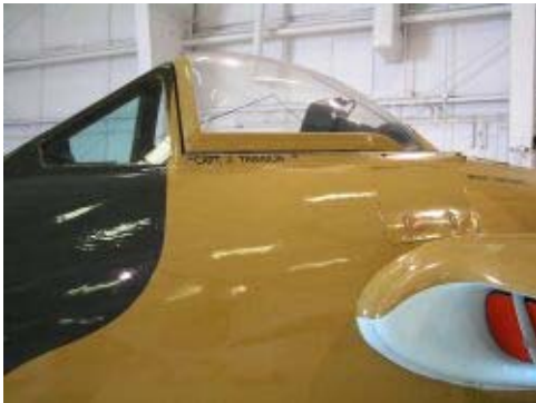
BELONGED TO JOHN TRAVOLTA