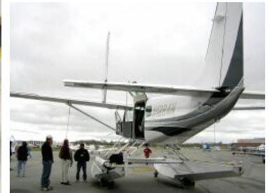
TAKE TO THE WATER