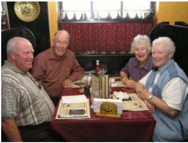
A lively crew