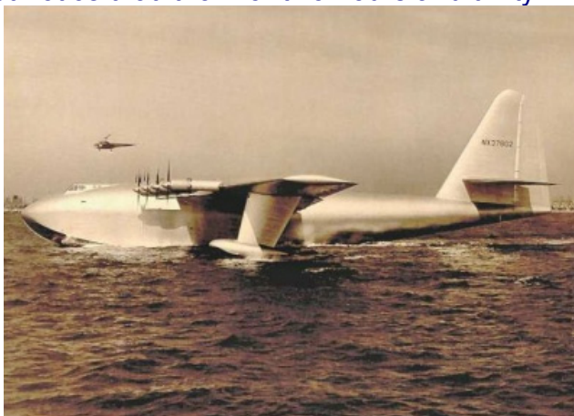
The "Spruce Goose", Hughes' H-4 Hercules