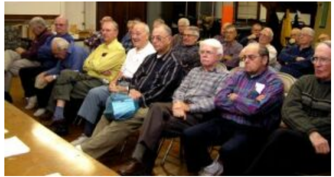
Do closed arms mean closed minds?