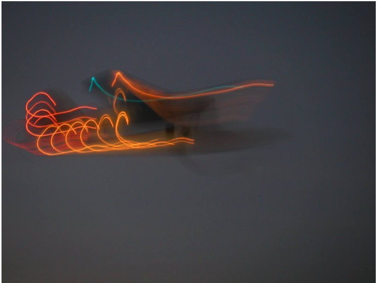
It's a Lighted Plane !