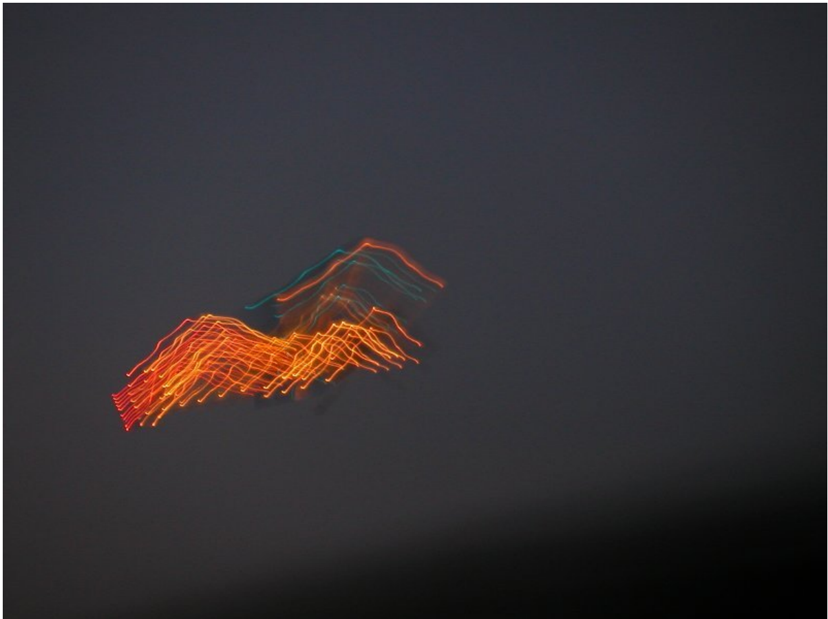
What is it?