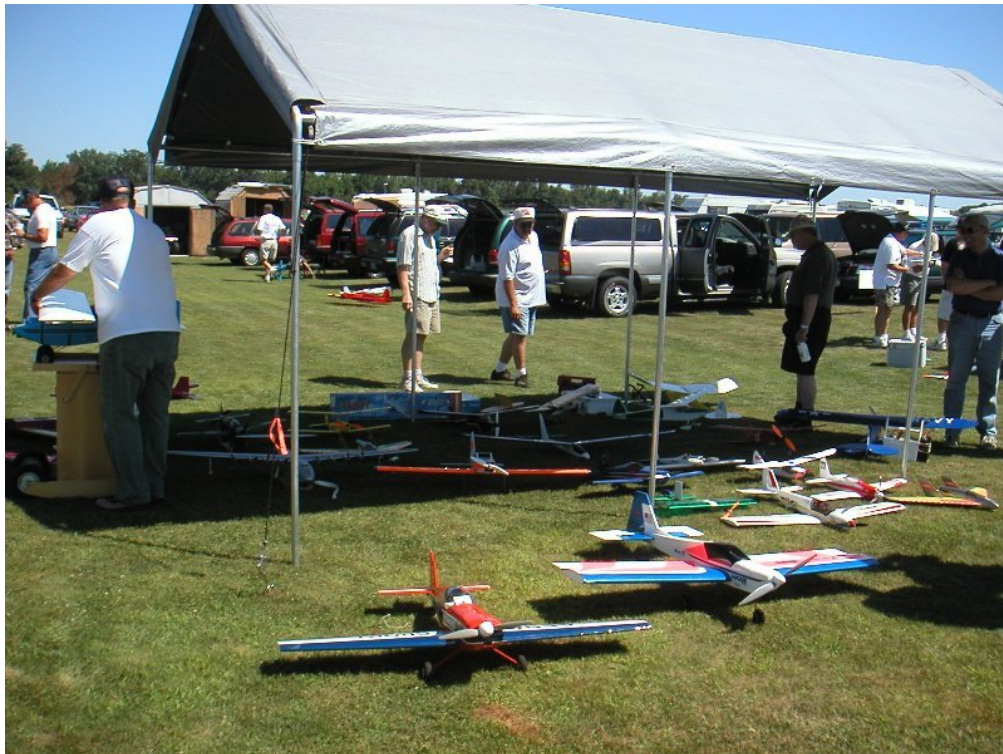
Great Electric Fun Fly

Look for them at our fields to help them along or just to say hey!