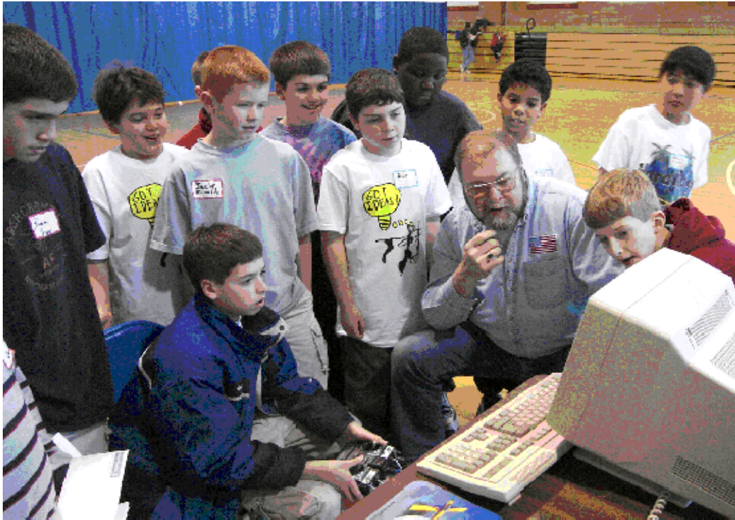
RCCR sponsors Model Demonstration, and Display for children at Brighton High School